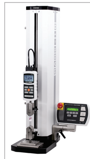
Shown with an ESM303 test stand and G1061 wedge grips

On-board data memory for up to 1,000 readings is included, as are statistical calculations with output to a PC. Integrated set points with indicators and outputs are ideal for pass-fail testing and for triggering external devices such as an alarm, relay, or test stand. The gauges are overload protected to 200% of capacity, and an analog load bar is shown on the display for graphical representation of applied force.